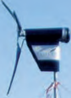
Proven WT 0.6