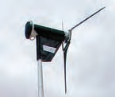
Proven WT 6