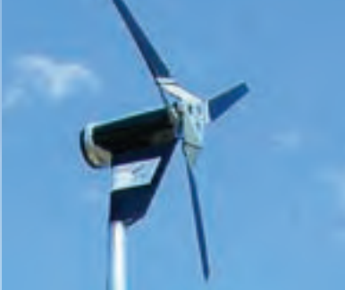
Proven WT 2.5